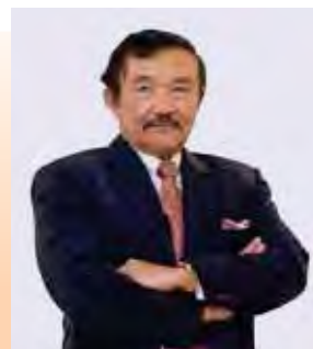
Chairman of The Audit Committee Member of the Audit Committee Member of the Audit Committee