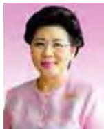
Khunying Suchada Kiranandana