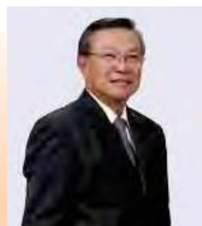
Chairman of Audit Committee Audit Committee Audit Committee